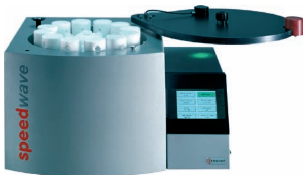
Figure 3 The speedwave MWS-3 + microwave digestion system.

progression of each sample must be continuously recorded and the microwave power must be regulated accordingly. From a safety aspect, it is therefore most practical that the pressure progression be recorded in parallel with the temperature, and that this measurement also be employed to influence power regulation. In this way, optimal process control can be achieved, particularly from the point of view of safety.