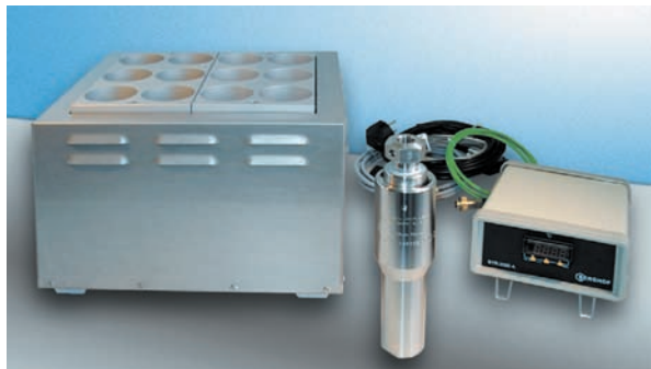
Figure 2 Stainless steel pressure digestion system with a 12-sample heating block and temperature regulator.

process. For this reason, a wide variety of sensor systems have been developed to monitor pressure and temperature reaction parameters and thus possibly control the microwave output.