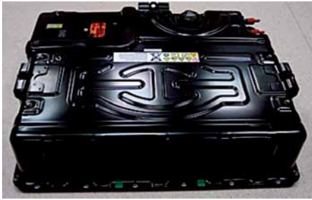
High Voltage Battery Pack BMW X6 (ActiveHybrid X6).

Berghof Process Engineering presented new products such as test systems for power electronics, PETS (Power Electronics Test Systems), as well as test and conditioning systems for energy storage in vehicles. The High Voltage Battery Pack for the BMW X6 (ActiveHybrid X6) proved to be a special eye catcher on site. In this setting Berghof cooperated with BMW AG to demonstrate the use of the BMS Battery Management System.