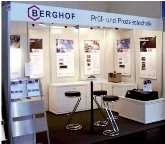
Berghof stand at the eCarTec 2011 in Munich

The trade fair showed that the fundamental principles of the technologies for electric drives, energy storage and grid infrastructure have already